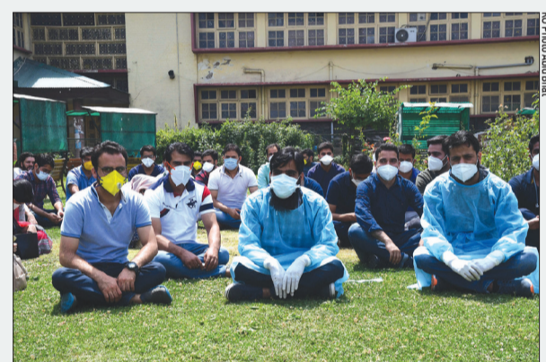
Doctors again struck work on Saturday demanding security.

REGARDING A CASE FROM Budgam, an official said that lady from Khanshabudgam who was admitted on July 03 died at SMHS on Saturday and she was suffering from bilateral pneumonia.