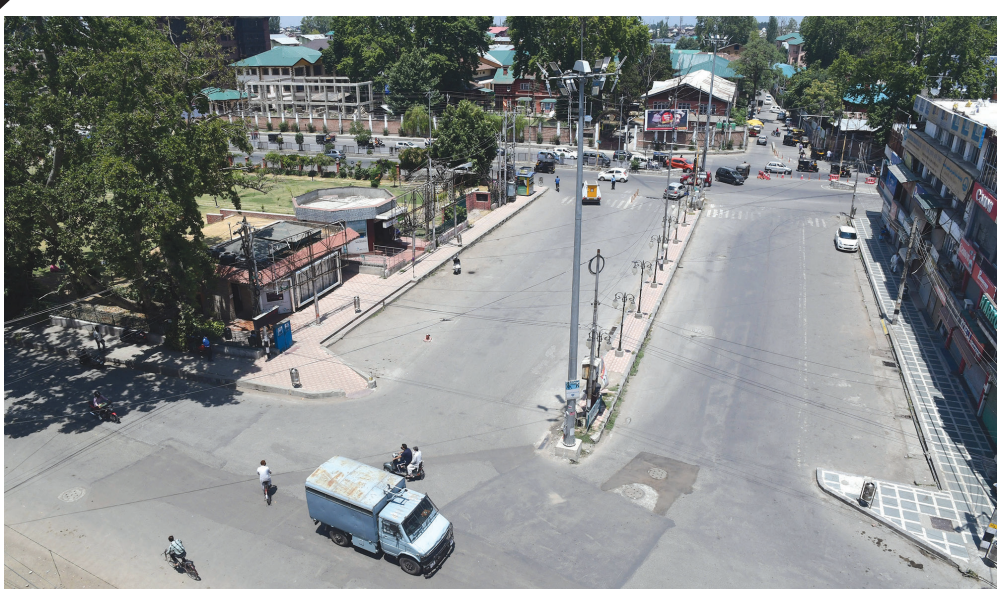
SRINAGAR CITY CENTRE wore a deserted look on Tuesday following reimposition of lockdown by the district administration to flatten the curve.

The Lt Governor also e-inaugurated six developmental projects worth Rs 8.52 cr and laid foundation stones of five projects worth Rs 21.52 cr for Bandipora