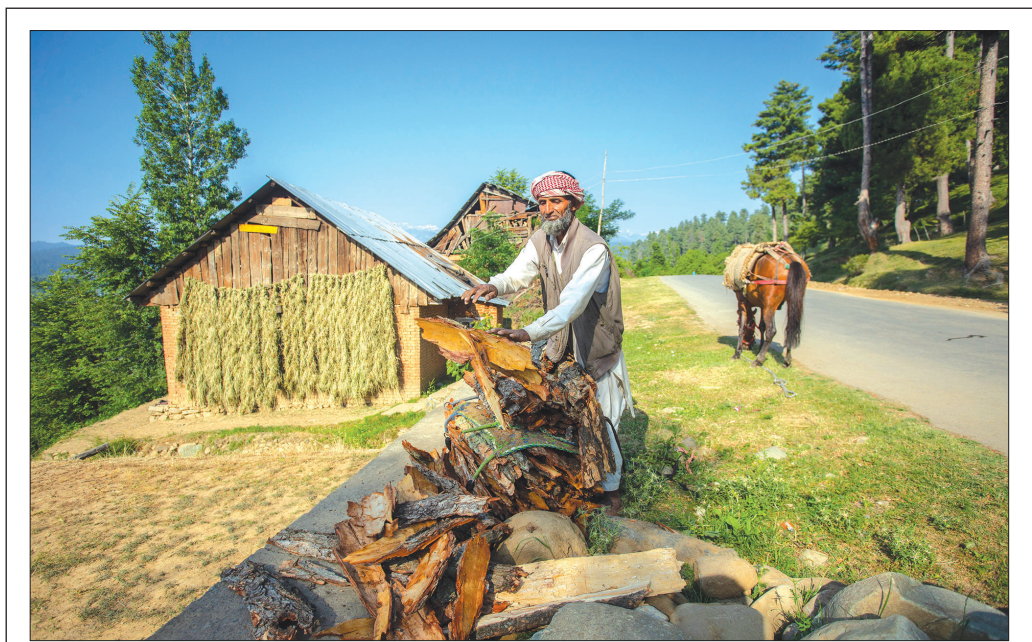
A KASHMIRI nomad collects firewood with a panoramic background of Sindh Valley

Officials said the dedication of the bridges to the people of Jammu and Kashmir carries a bigger message that India will continue to develop key infrastructure in border areas notwithstanding hostilities by any adversary. Our government is ►PAGE 02