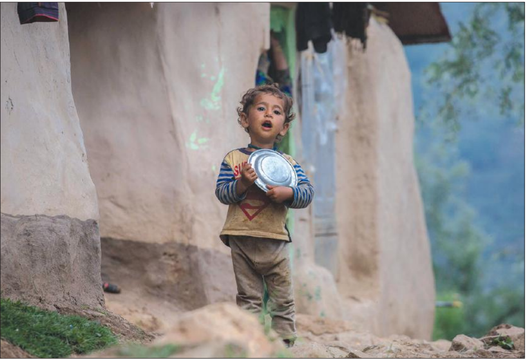
A CHILD IN DHARA, HARWAN shouts at photographer who clicked his photo.