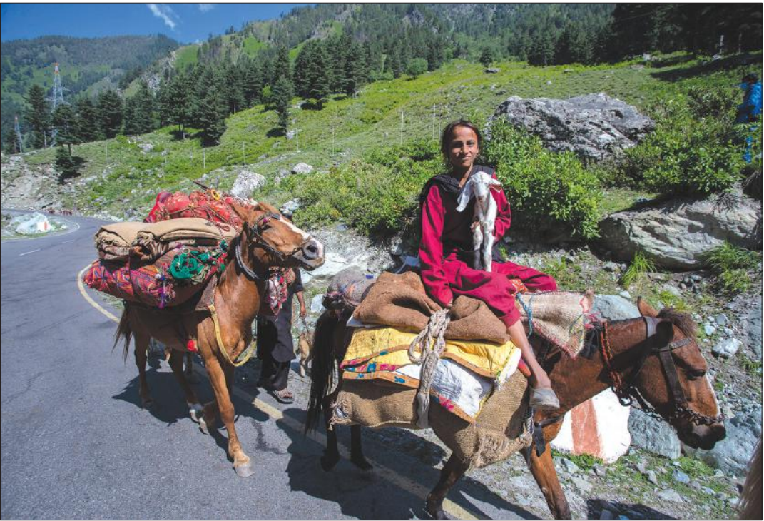
A NOMAD GIRL CARRYING a goat in her hands enroute to greener pastures of Sonmarg on Wednesday.

duty in Union Territory of Jammu and Kashmir after issuance of Notification SO 201 dated 24th June, 2020, regarding, The Jammu & Kashmir Stamps (Payment of Duty by Means of e-Stamping) Rules, 2020. In this connection it is clarified that the existing system of payment of stamp duty shall continue to be a mode of payment of stamp duty in the Union Territory of Jammu and Kashmir till further order" the Government clarified.