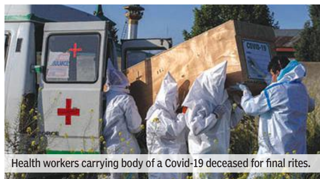
Health workers carrying body of a Covid-19 deceased for final rites.