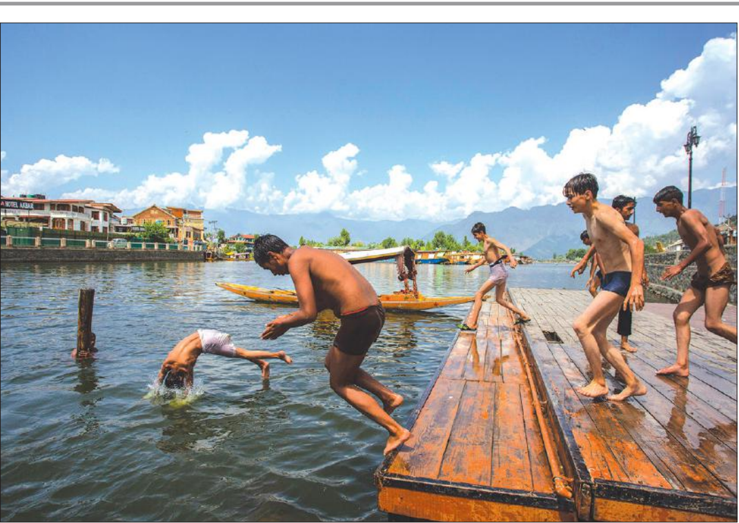
COOLING OFF- With mercury jumping to all time high this season boys enjoy swimming in Dal waters on Tuesday