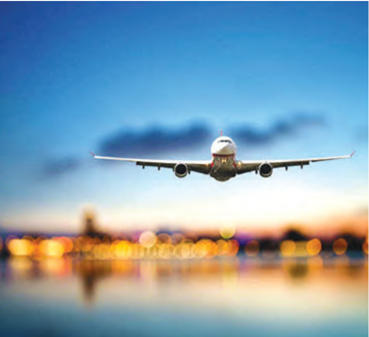
the Central government. India resumed scheduled domestic passenger flights on May 25, after a gap of two months. PTI

NEW DELHI: The aviation regulator DGCA said on Friday it is extending the suspension of scheduled international passenger flights in the country till July 15 but added that some international scheduled services on select routes may be permitted on a case-to-case basis. Scheduled international passenger flights were suspended in India on March 23 due to the coronavirus pandemic. "The competent authority has decided that scheduled international commercial passenger services to or from India shall remain suspended till 2359 hrs IST of July 15, 2020," said the DGCA circular. "However, international scheduled flights may be allowed on selected routes by the competent authority on a case to case basis," said the circular by the Directorate General of Civil Aviation (DGCA). Air India and other private domestic airlines have been operating unscheduled international repatriation flights under the Vande Bharat Mission, which was started on May 6 by