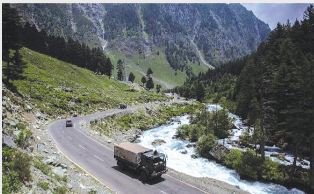
An Army convoy on way to Ladakh.

Asia. The country which became epicenter of the COVID pandemic, he said, is on the warpath now to manage global perceptions.