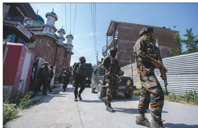
A GROUP OF SOLDIERS walking towards the encounter spot in Meej area of Pampore on Friday.