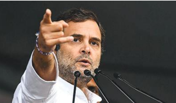
earlier said on Twitter.

"Let us get the facts straight. All troops on border duty always carry arms, especially when leaving post. Those at Galwan on 15 June did so,"