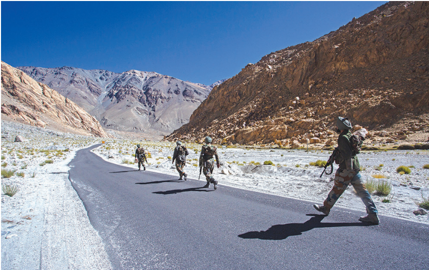
Soldiers patrolling an area in the mountainous Ladakh Union Territory.