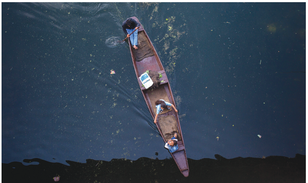
A MAN ferries two young girls in his boat in Nigeen Lake of Srinagar on Saturday.

"And above all, the government should have thought how will the employees commute when the Valley is under lockdown. Even some employees from the middle class down have own transport. ▶▶PAGE 02