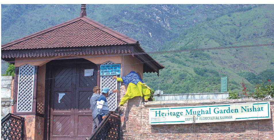
A WOMAN SCALES WALL OF FAMED NISHAT MUGHAL GARDEN here on Friday, as the ban on public parks and gardens remains imposed.

China has appointed a new Army commander for its Western Theatre Command ground forces responsible for the Sino-India border, ahead of the key talks between senior Indian and Chinese military officials on Saturday to end the border standoff. ● P-02