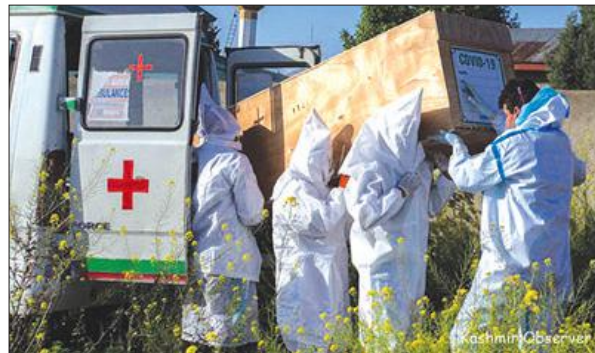
HEALTH WORKERS carrying the body of a Covid-19 deceased in Srinagar outskirts.

We have decided to postpone the proposed strike after an hour-long meeting with Transport commissioner and Deputy Commissioner Jammu. They also managed firewood for helping the KP family to cremate the deceased. ►P-02