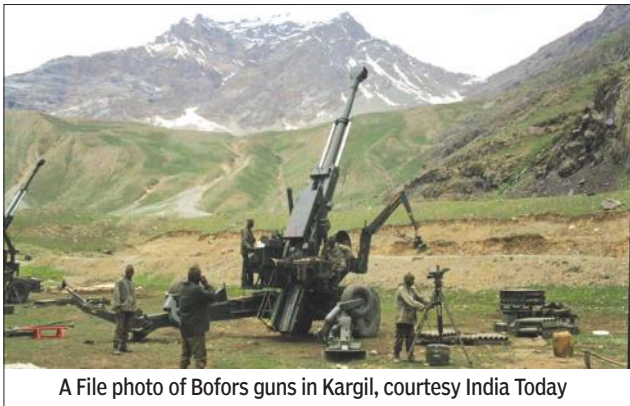
A File photo of Bofors guns in Kargil

The report further says that army wants the issue to be resolved through negotiations but at the same time they maintain that construction activity in the areas close to LAC won't be stopped. ►PAGE 02