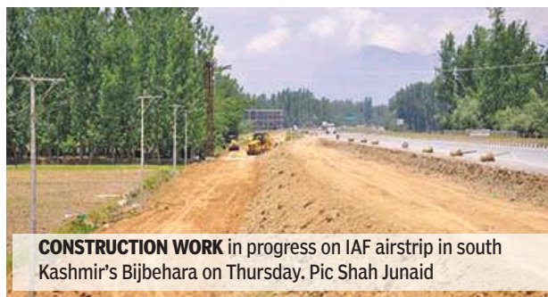
CONSTRUCTION WORK in progress on IAF airstrip in south Kashmir's Bijbehara on Thursday.

The officer had been accused of "releasing several inmates without seeing their ● P-02