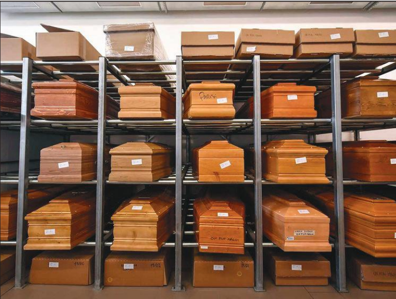
Coffins are placed on scaffolding awaiting burial due to the coronavirus emergency in Italy

I don't like the term climate change to describe what's coming. I much prefer "global weirding," because the weather getting weird is