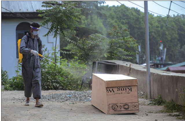
A MUNICIPALITY worker disinfects a casket of a Covid-19 deceased at Srinagar hospital.