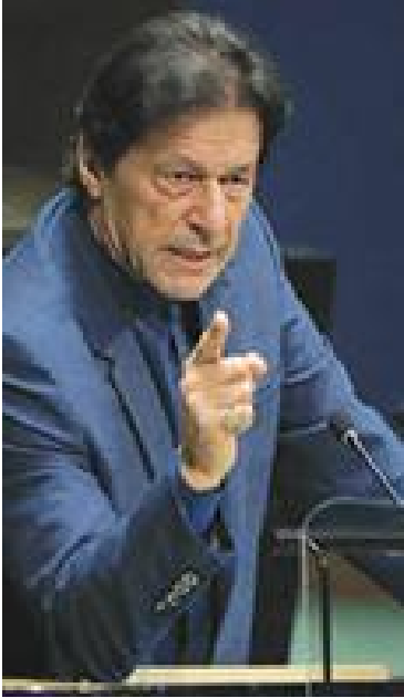
Pakistan and China consider their relations as all-weather friends and

ISLAMABAD: Pakistan Prime Minister Imran Khan on Wednesday alleged that the Indian government's "arrogant expansionist policies" is becoming "a threat" to its neighbours as he tried to curry favour with Islamabad's all-weather ally, China. The Indian government "with its arrogant expansionist policies, akin to Nazi's Lebensraum (Living Space), is becoming a threat to India's neighbours. Bangladesh through Citizenship Act, border disputes with Nepal & China, & Pak threatened with false flag operation," Khan said in a series of tweets. Several areas along the 3,500-km-long Line of Actual Control (LAC) in Ladakh and North Sikkim have witnessed major military build-up by both the Indian and Chinese armies recently, in a clear signal of escalating tension and hardening of respective positions by the two sides even two weeks after they were engaged in two separate face-offs. The LAC is the de-facto border between India and China.