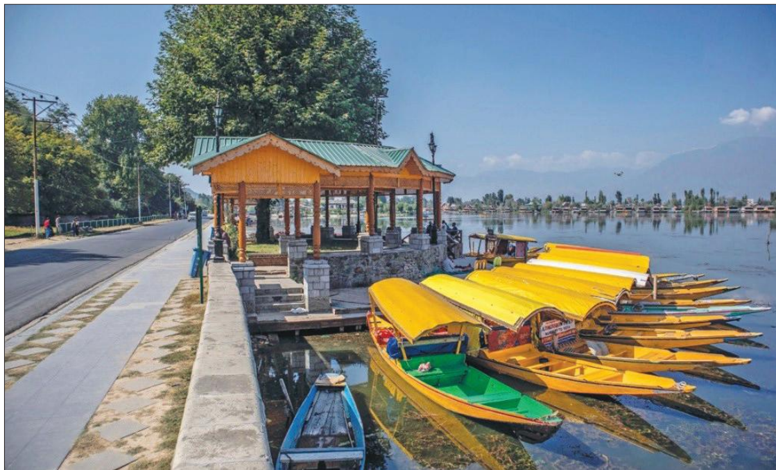
Dal Lake Sans Tourists

Globally famous Dal lake is narrating the tale of its prolonged solitude. The empty houseboats seem to be stiffened in the thick ice cover of winter. The