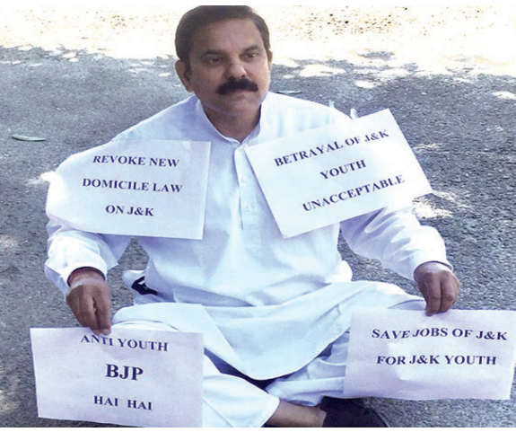
big lines in near future to prove their resident-ship on the basis of PRCs," Rizvi said. "It's as good, as falling in line for

"While these non-locals can easily avail domicile certificates online, I see natives falling in