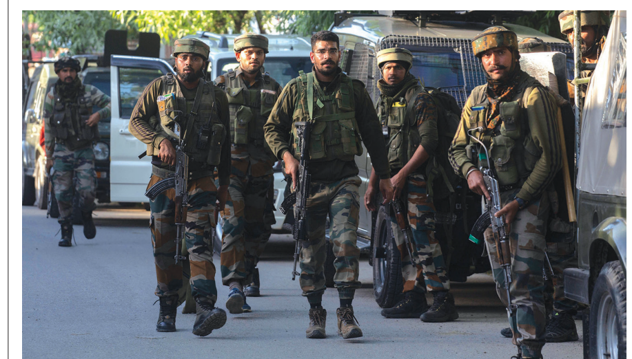
A GROUP OF SOLDIERS inspecting Pandach area of Ganderbal on Wednesday after a militant attack left two BSF men dead.