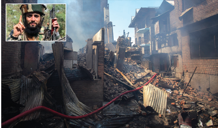
A LAYER OF THICK SMOKE EMANATING on Tuesday from the debris of houses damaged during overnight gunfight in Nawa Kadal area of Srinagar.