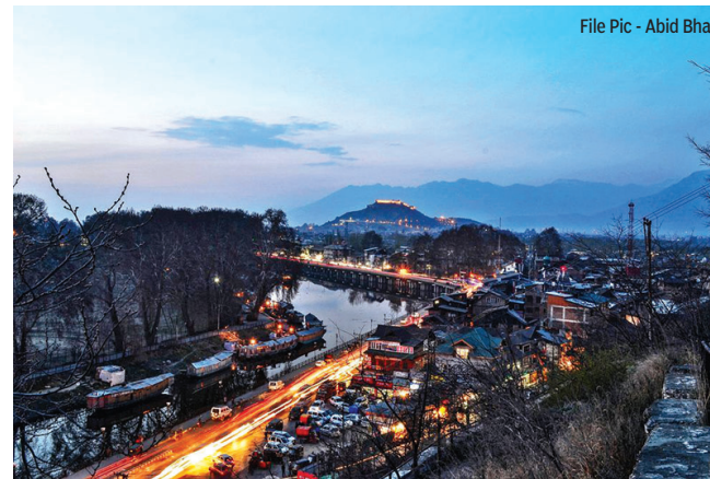
File Pic - Abid Bhat

In a statement issued to media, a Hurriyat Conference (M) said that in the garb of coronavirus and the lockdown following it, the govern-