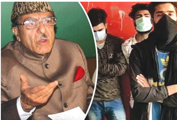
For his 'selfless' gesture, the unionist has already become "Salvador" for these stranded Kashmiris.

The senior leader has been actively participating in bringing back the marooned Kashmiris home from various Indian states and different parts of the world and making all the required arrangements for it.