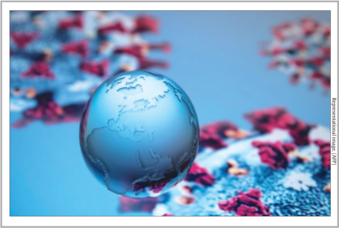
Representational image.

rebate in revenue share * Rs 50,000 crore earmarked for infrastructure development in coal sector * Coal Bed Methane (CBM) extraction rights to be auctioned from Coal India's mines * To introduce seamless composite exploration-cum-mining-cum-production regime in minerals sector; 500 mining blocks to be auctioned * Introduce joint auction of bauxite and coal mineral blocks * To rationalise stamp duty payable at the time of award of mining leases Power Distribution: * To bring out reform in tariff policy, privatised Discoms in Union Territories Social Infrastructure: * Govt's share in viability gap funding for development of social infrastructure, including hospitals, hiked to 30 per cent from 20 per cent, total outlay Rs 8,100 crore Space: * To allow private sector companies in satellites, launches and space-based services * Private sector will be allowed to use ISRO facilities and other relevant assets to improve their capacities Atomic Energy: * To set up a research reactor in PPP mode for the production of medical isotopes to help make available affordable treatment for cancer and other diseases * Establish facilities in PPP mode to use irradiation technology for food preservation – to complement agricultural reforms and assist farmers. PTI