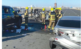
"One car burst into flames and three people in it were killed", Dubai police said.

The accident happened when the victims' vehicle halted due to another traffic accident on the road and another vehicle crashed into their car from behind which caused the fire.