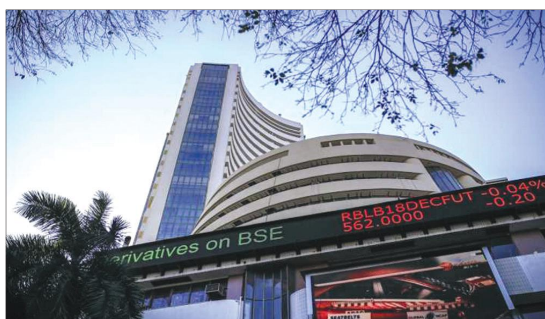
EQUITY BENCHMARK SENSEX rallied over 1,400 points in opening session on Wednesday as Prime Minister Narendra Modi's Rs 20 lakh crore stimulus package.

As many as 4.83 lakh direct tax cases involving Rs 9.32