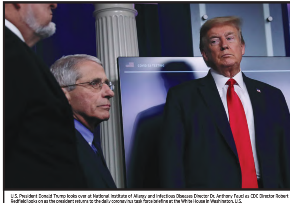
U.S. President Donald Trump looks over at National Institute of Allergy and Infectious Diseases Director Dr. Anthony Fauci as CDC Director Robert Redfield looks on as the president returns to the daily coronavirus task force briefing at the White House in Washington, U.S.

"About three to five million residents have been tested and proved healthy, and thus Wuhan is capable to test the remaining 6 to 8 million in 10 days."