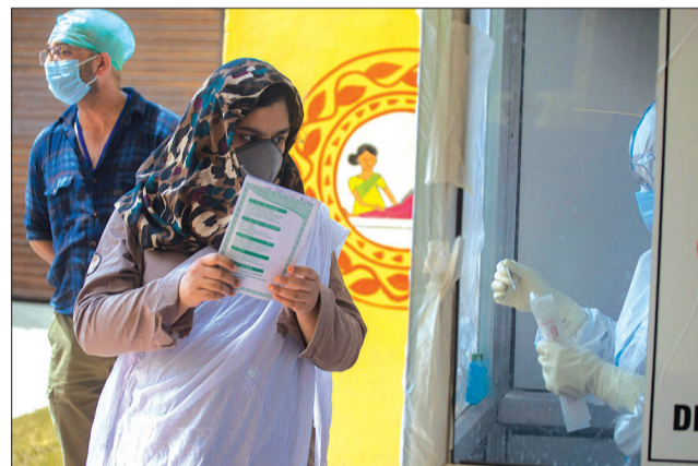
AN EXPECTING MOTHER STANDS near a Covid-19 screening booth at a health centre in Srinagar on Saturday.

According to the media bulletin issued by the government today, 43917 samples out of 44753 have tested as negative till May 09, 2020. "Furthermore, till date 90541