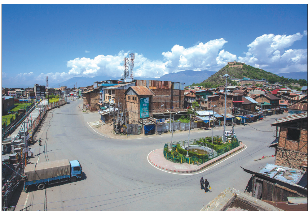
A CRPF Vehicle Deployed Outside The Historic Jamia Masjid In The Old City Of Nowhatta On Thursday.

SRINAGAR: The number of coronavirus patients crossed 600-mark in Jammu and Kashmir as thirty three more people tested positive for the Pandemic in Valley onThursday. "Thirty three new cases have been reported from Kashmir in the last 24 hours," the officials said, adding that equal twenty four more patients have recovered and were discharged from various hospitals. Among fresh cases, twelve are from Anantnag, eleven from Baramulla, four from Kulgam, two each from Srinagar and Pulwama and ● P-02