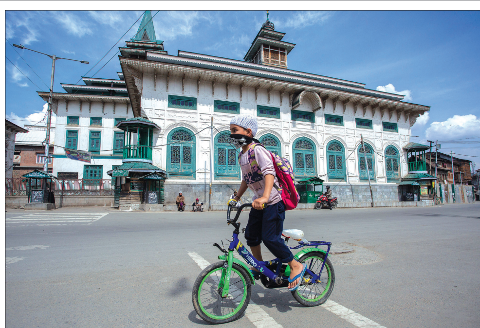
AMID LOCKDOWN, A BOY RIDES A BICYCLE near the shrine of Dastgeer Sahab (RA) in the Old City of Srinagar on Wednesday.

Of the total number of cases reported so far, 523 are from Kashmir and 58 from P-02