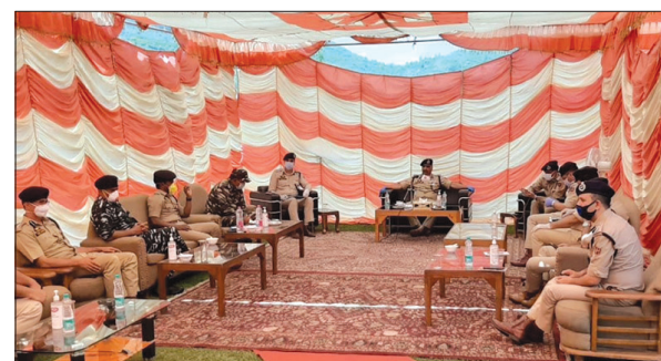
peace in the Union Territory, a police spokesperson said.