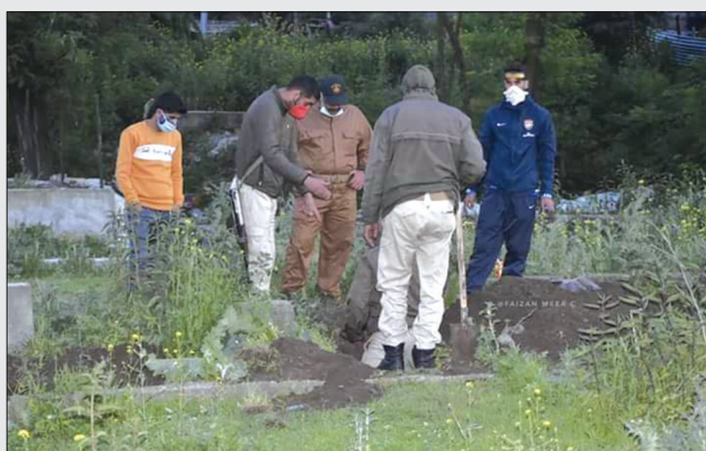
A photo of burial that went viral on Social Media

"Her large family of around 30 members was sent to quarantine soon after she was detected carrying the coronavirus. So this argument of abandoning her just