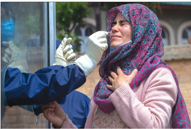
A HEALTH OFFICIAL takes swab sample for Covid-19 test of a city resident at a centre in Srinagar-KO Photo by Abid Bhat

Regarding the five cases from Shopian, the sources said includes 2-year-old girl and a ●PAGE 02