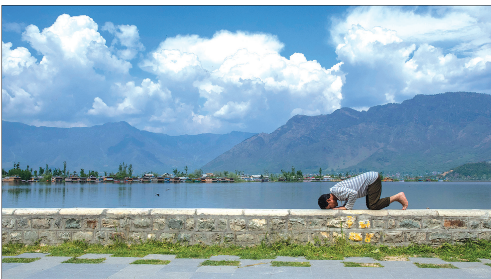
SOLITUDE: On the second day of Ramazan, a man is seen praying on the banks of Dal Lake amid lockdown