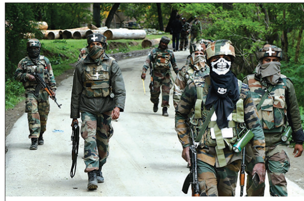
Soldiers at an encounter site

SRINAGAR: Three militants were killed in an encounter with government forces at Lower Munda area of Qazigund in south Kashmir's Kulgam district on Monday. Bodies of all the militants have been recovered, officials said.