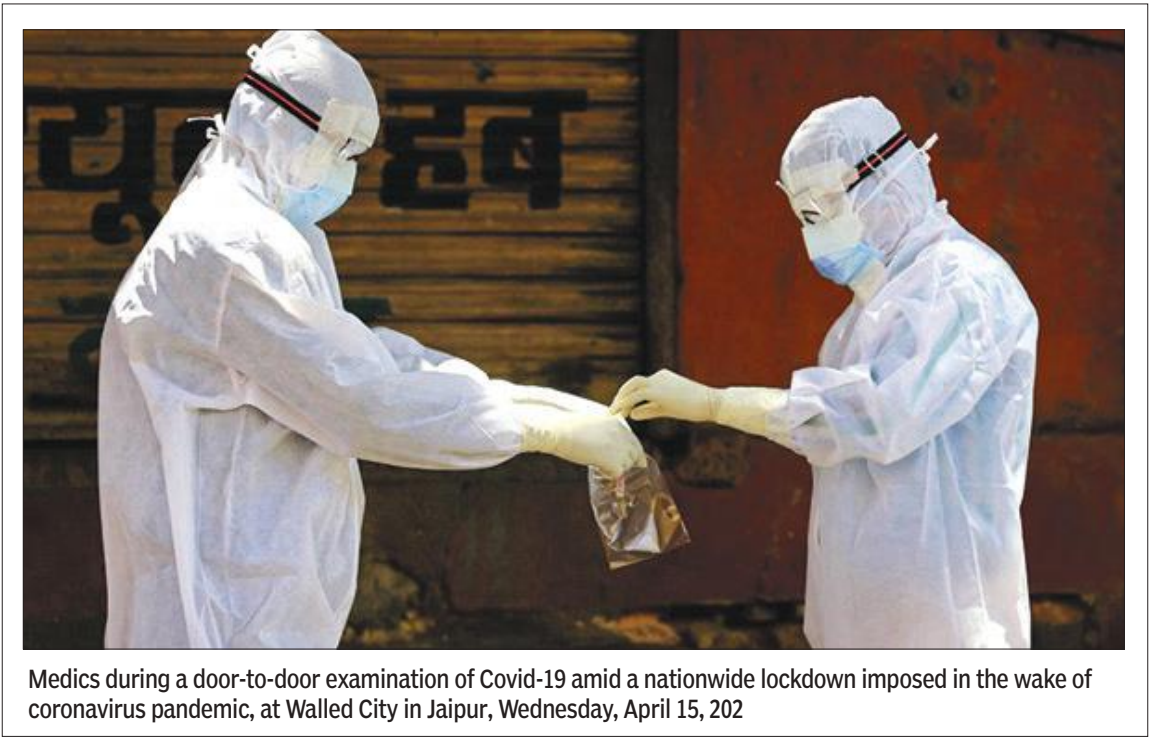
Medics during a door-to-door examination of Covid-19 amid a nationwide lockdown imposed in the wake of coronavirus pandemic, at Walled City in Jaipur, Wednesday, April 15, 202

labelling, bags/containers used for collecting biomedical waste from COVID-19 wards, should be labelled as 'COVID-19 Waste', it said adding that general waste not having contamination should be disposed as solid waste as per Solid Waste Management Rules, 2016. "Maintain separate record of waste generated from COVID-19 isolation wards. Use dedicated trolleys and collection bins in COVID-19 isolation wards. A label 'COVID-19 Waste' to be pasted on these items also. The (inner and outer) surface of containers/bins/trolleys used for storage of COVID-19 waste should be disinfected with 1 per cent sodium hypochlorite solution daily. "Report opening or operation of COVID-19 ward and COVID ICU ward to SPCBs and respective CBWTF located in the area. Depute dedicated sanitation workers separately for biomedical waste