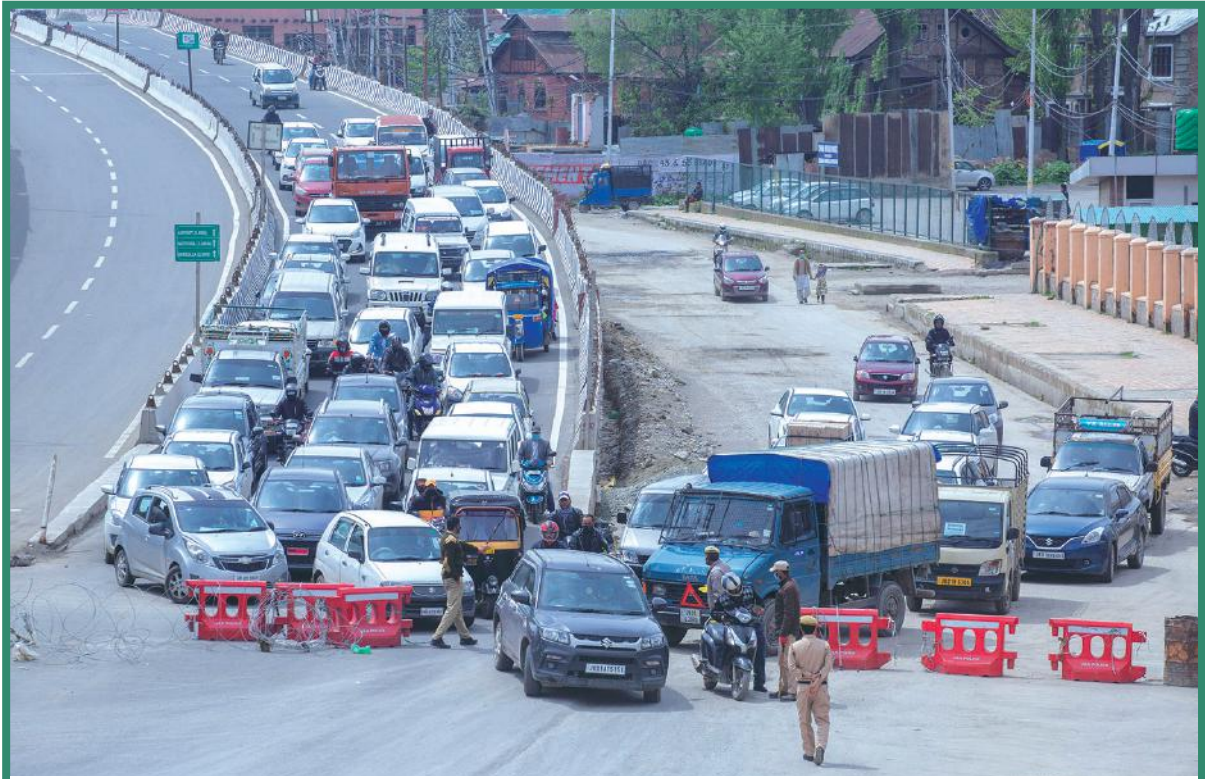
Cops regulating traffic on the Rambagh flyover crossing in Srinagar on Monday.