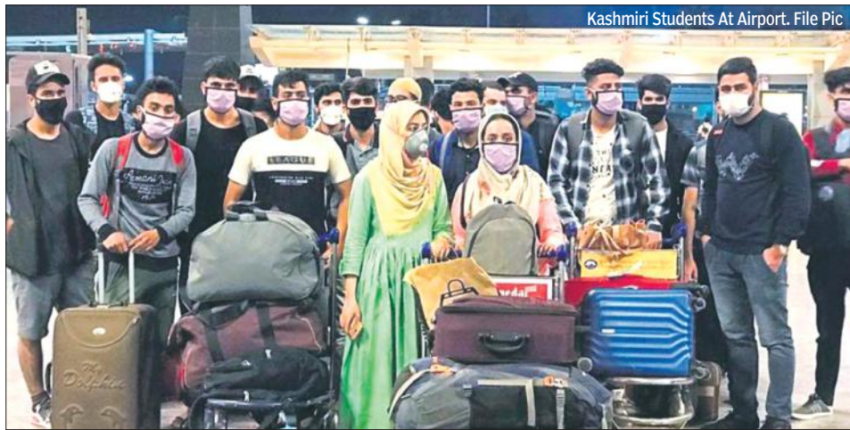
Kashmiri Students At Airport.

"It's a matter that needs to be taken up with the Himachal Pradesh Govt. on war-footing," Prof stressed.