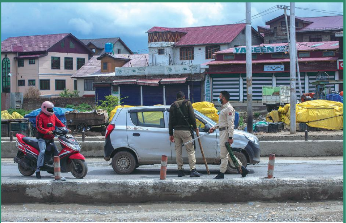
Policemen enforcing restrictions in part of this capital city on Monday.