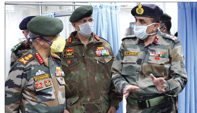
taining to the Line of Control and Gen Naravane applauded the jawans for their morale ▶ PAGE 02

'The Chief of Army staff was briefed by the Chinar Corps Commander at Badami Bagh Cantonment on the overall situation per-