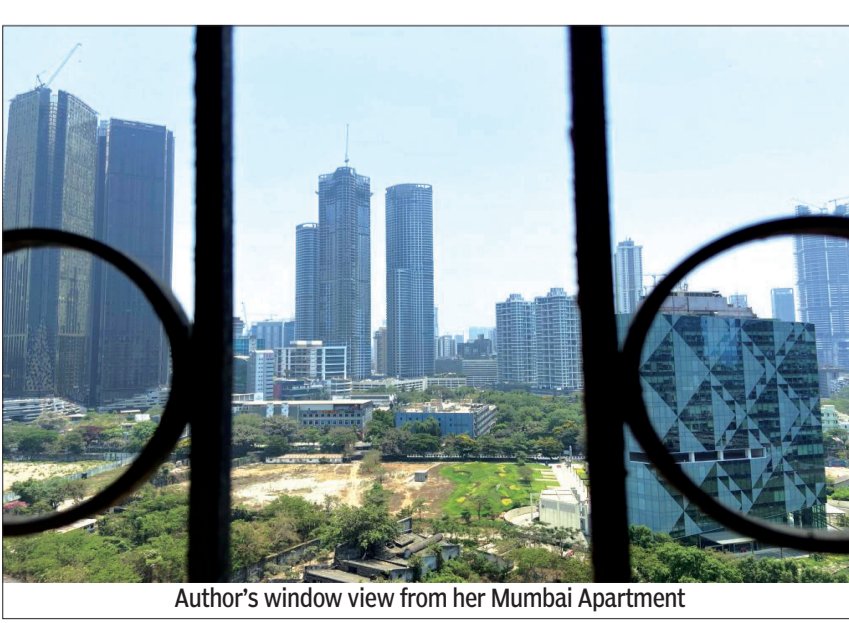
Author's window view from her Mumbai Apartment