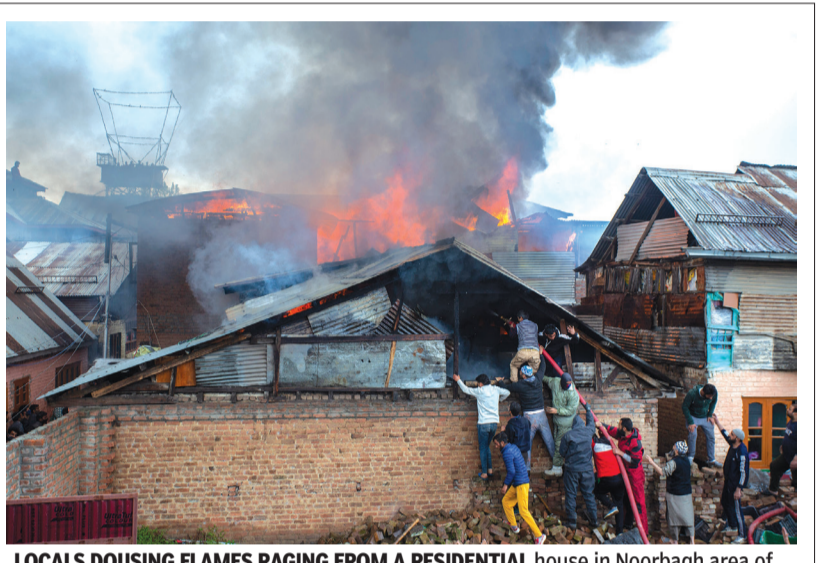
LOCALS DOUSING FLAMES RAGING FROM A RESIDENTIAL house in Noorbagh area of the city on Wednesday.

SRINAGAR: The Jammu and Kashmir administration on Wednesday ruled out relaxation in the lockdown extended till May 3, saying that a significant spike might be witnessed in coronavirus cases in the coming days due to aggressive testing. Divisional Commissioner Kashmir, Pandurang K Pole told Kashmir Observer that all the districts in Kashmir have red zones and due to which stricter norms will remain in place and there will be no ease in lockdown restrictions. The restrictions, he said will remain stricter in red zones within the districts. "First of all, the districts have to be categorized in red, grey and green zones. As of now, no district of the Valley falls in green zone. All the districts are in red zones," Pole said.