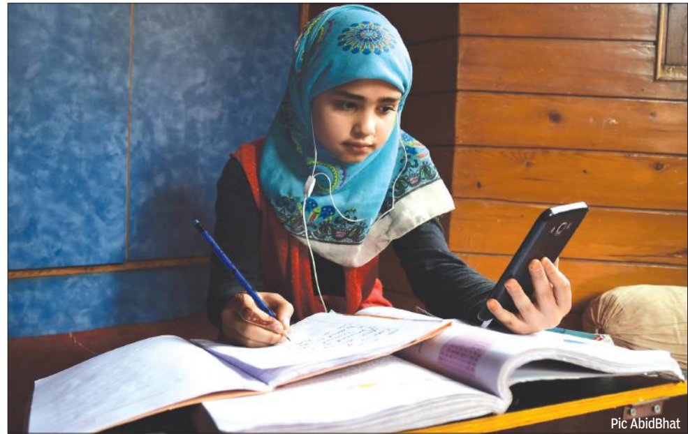
A GIRL STUDENT DOWNLOADING STUDY material at her house in Natipora area of the City on Tuesday.

SRINAGAR: Expressing serious concern over the loss of precious lives due to frequent skirmishes along the Line of Control (LoC) in north Kashmir, Jammu and Kashmir Apni Party (JKAP) on Tuesday demanded immediate construction of underground bunkers in order to save the life of inhabitants of forward areas in Jammu and Kashmir. In a joint statement issued here, the JKAP leaders extended solidarity with the bereaved families of three deceased including a minor boy