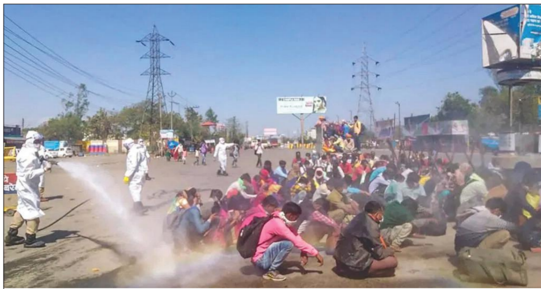
Migrant workers returning from their cities of work amid India's lockdown, were sprayed with disinfectants

Another moral dilemma is that in case the doctors and the nursing staff refuse to attend the corona patients in view of the increasing number of infections among them, shall we force them to work, some sort of conscription that we may have to resort to if the numbers of positive cases increases to an extent where we don't have adequate medical staff to attend the patients.