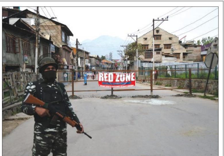
A CRPF TROOPER STANDS GUARD IN THE RED ZONE declared locality of uptown Srinagar on Tuesday.

Admitting that the lockdown has come at a huge economic cost, Modi, however, asserted that India has chosen the correct path, and managed to avert to a large extent the damage caused by the pandemic in many countries. He also noted that most of the state governments, experts and other stakeholders recommended the extension of the lockdown to contain the spread of COVID-19 pandemic. There are 10,363 confirmed cases of coronavirus with 339 deaths due to COVID-19 so far in India, as per the Union health ministry data.