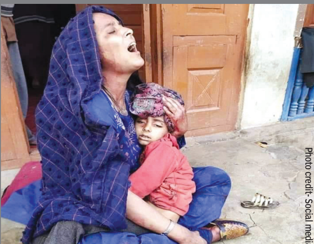
laging mother with the body of her 8 year old son who died after being hit by a shrapnel during cross LOC shelling in village Tumina in Kupwara on Sunday.

Their cries made a howling sound, as a shrapnel-wounded vil-