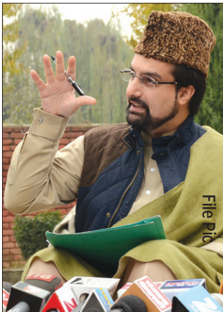
title of 14th Mirwaiz in 1990 at the age of 17 after the assassination of his father. "At the young age of 20 he became chairman and founder ▶PAGE 02

Jordan based Royal Islamic Strategic Studies Centre (RISSC), an international Islamic non-governmental organization has released the list of the world's most 500 influential Muslims for the year 2020 in which Mirwaiz figures for the sixth consecutive time. The Hurriyat Chairman inherited the