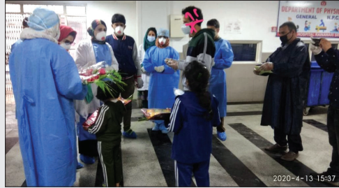
pital Rainawari Srinagar along with their mother who was COVID-19 Negative but was staying with her daughters. The repeat samples of ▶PAGE 02

"First two COVID-19 Positive children discharged today from JLNH Hos-