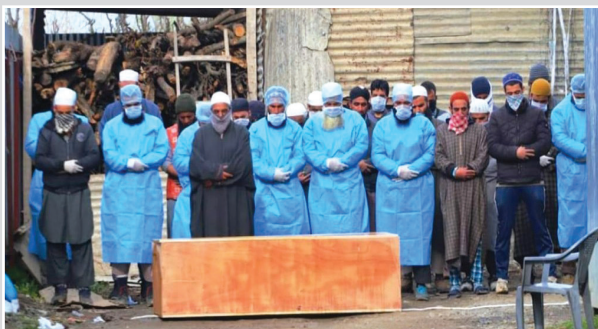
THE FUNERAL OF 65-YEAR OLD BUSINESSMAN WHO SUCCEMPTED TO COVID-19 was held in his native Sopore on Thursday.

Resident of Shah Anwar Colony, Hyderpora the man originally hailed from Sopore. He had returned from New Delhi recently after attending a congregation of 'Tablighi Jamaat' there. ● P-02