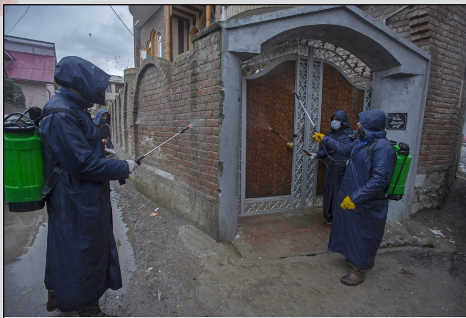
SMC MEN SANITIZE NATIPORA LOCALITY IN SRINAGAR after a resident there tested positive for Coronavirus on Tuesday.

"The sample of the youth admitted to Government Medical College Baramulla came positive to the infection. His swabs were sent to SKIMS for laboratory tests," a senior doctor was quoted as saying.