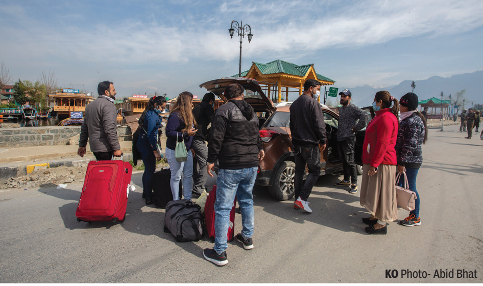
TOURISTS WHO HAD REMAINED IN SRINAGAR BEING SHIFTED out of their hotel on Boulevard for onward journey.

SRINAGAR: As all domestic flights were being cancelled from Tuesday night, the Jammu and Kashmir administration on Monday decided to seal interstate borders and restrict the movement of vehicles across the districts in a bid to contain the spread of deadly coronavirus.