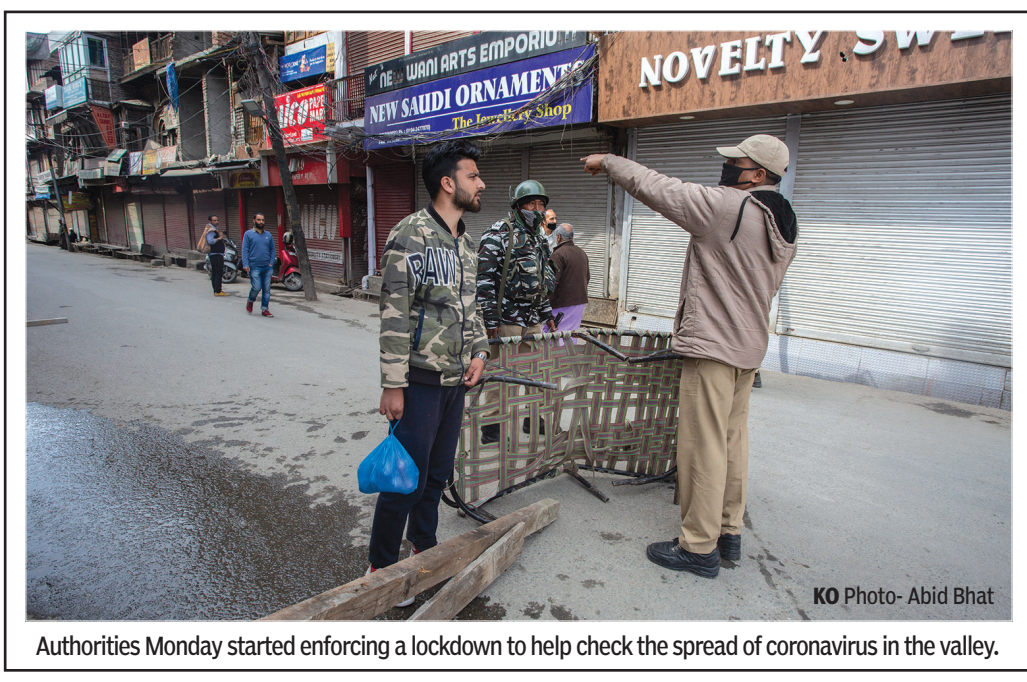
Authorities Monday started enforcing a lockdown to help check the spread of coronavirus in the valley.

According to him, one crore people from Jammu and Kashmir were earlier left out of the Centre's flagship health scheme Ayushman Bharat, but now every resident of the union territory will be covered. Pointing out that six roadshows were held in the union territory recently, he said the Centre is committed to attract investments worth thousands of crores into Jammu and Kashmir. He highlighted that three circuits have been announced for Jammu and Kashmir, with a view to draw tourists in large numbers. The Upper House also approved and returned to Lok Sabha another bill for the budget of Ladakh, as required under rules for money bills. The bills were approved with voice vote after a debate P-02