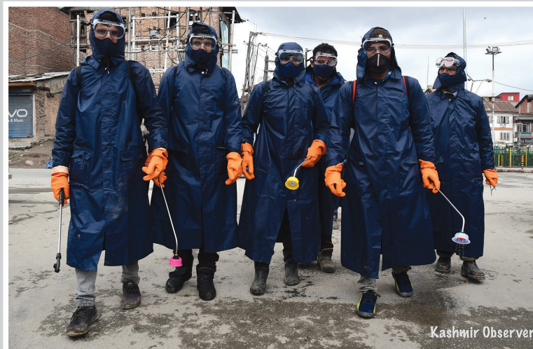
SMC SQUAD CARRYING OUT SANITIZATION drive amid coronavirus scare in Srinagar

According to the government spokesperson, 2478 travellers and persons in contact with suspected cases have been put under surveillance while as 2095 persons are under home quarantine. "Persons who are in hospital quarantine stand at 29 and 178 persons are under home surveillance," the spokesperson said. PAGE 10