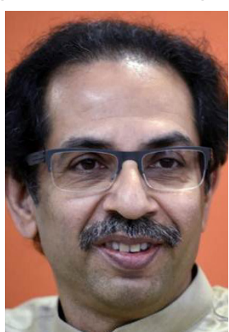
Talking to Twitter this morning, senior Sena leader Sanjay

He further announced that he will be donating a sum of Rs one crore for the Ram temple. "This sum is not from the government but from my trust" he highlighted.