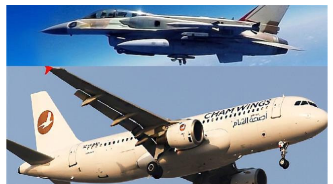
The Israeli attack took place as Syria troops were liberating the terrorist-held town of Saraqib in northwestern Idlib province, further tightening the noose on the foreign-backed terrorists there.

Many observers, including Canadian Prime Minister Justin Trudeau, have pointed that the