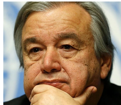
The two-day conference — "40 years of Afghan Refugees Presence in Pakistan: A New Partnership for Solidarity" — would be held in Islamabad on Feb 17-18. Prime Minister Imran Khan will inaugurate the conference, which will bring participants from 20 countries, the Ministry of Foreign Affairs said.

to consolidate peace in Afghanistan are making progress," a Foreign Office spokesperson told reporters in Islamabad. Diplomatic observers in Washington noted that the UN secretary general would be arriving in Islamabad in the middle of a major humanitarian and security crisis over India-held Kashmir.