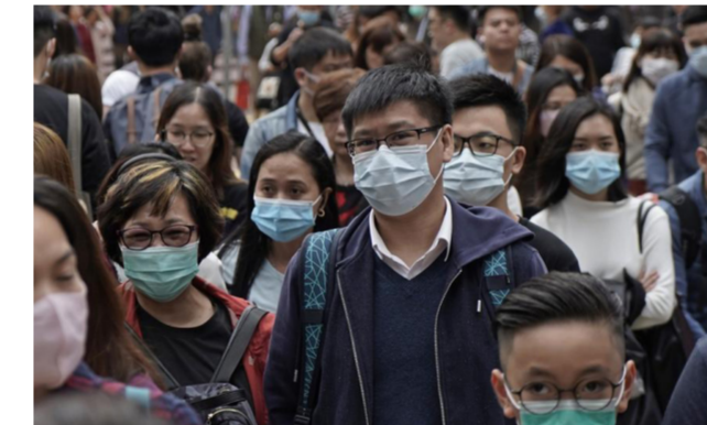
The new virus claimed its youngest victim. A 36-year-old man in Hubei was admitted to the hospital earlier this month after suffering from fever for three days. He died Thursday.

— The new virus claimed its youngest victim. A 36-year-old man in Hubei was admitted to the hospital earlier this month