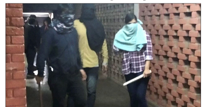
PRESS TRUST OF INDIA

NEW DELHI - The Delhi High Court on Tuesday asked WhatsApp and Google to provide information related to the JNU violence to police.