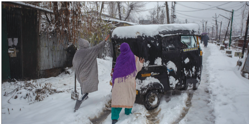
A FAMILY PUSHES THEIR AUTO RICKSHAW On A Slippery City Street Tuesday. Most Of The City Roads Remained Blocked For The Second Day- Pic Abid Bhat