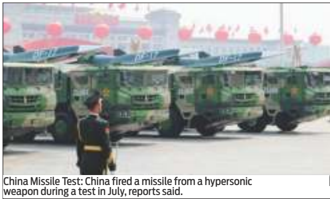
China Missile Test: China fired a missile from a hypersonic weapon during a test in July, reports said.

If China's tests of hypersonic weapons are confirmed, it would suggest that President Xi Jinping may be exploring orbital strikes as a way to counter American ad-