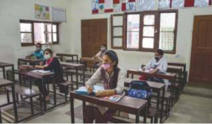
Educational disruption of this extent has alarming effects on learning loss and school dropout. Beyond this, it poses threats to gender equality, including effects on health, well being and protection that are gender specific

from about 90 countries and in-depth data collected in local communities, the report shows that gender norms and expectations can affect the ability to participate in and benefit from remote learning. "In poorer contexts, girls' time to learn was constrained by increased household chores. Boys' participation in learning was limited by income-generating activities. Girls faced difficulties in engaging in digital remote learning modalities in many contexts be-