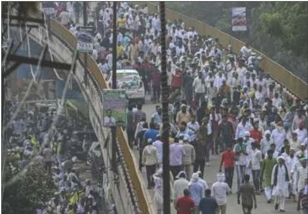
Farmers Protest: Thousands gathered for the latest rally in Uttar Pradesh's Lucknow. (Representational)

The mayor of the capital, Kabul, also told female municipal employees to stay home unless their jobs could not be