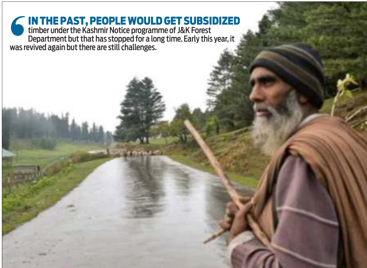
UNDER THE FOREST RIGHTS ACT, traditional forest dwellers are protected against forced displacements and have other rights as well.

IN THE PAST, PEOPLE WOULD GET SUBSIDIZED timber under the Kashmir Notice programme of J&K Forest Department but that has stopped for a long time. Early this year, it was revived again but there are still challenges.