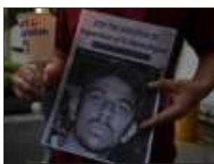
of making rational decisions.

He was scheduled to be hanged on Wednesday after losing a series of appeals, despite mounting international outrage and supporters' claims his intellectual disability means he is incapable