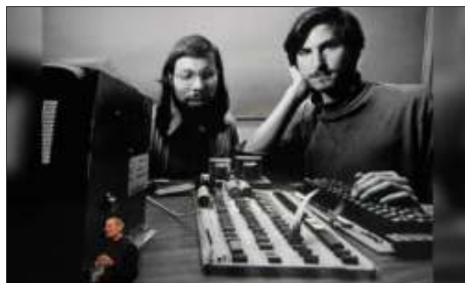
FILE PHOTO- Steve Jobs stands beneath a photograph of him and Apple-co founder Steve Wozniak from the early days of Apple during the launch of iPad in San Francisco, California, January 27, 2010

What makes it even rarer is the fact the computer is encased in koa wood -- a richly patinated wood native to Hawaii. Only a handful of the original 200 were made in this way. Jobs and Wozniak mostly sold