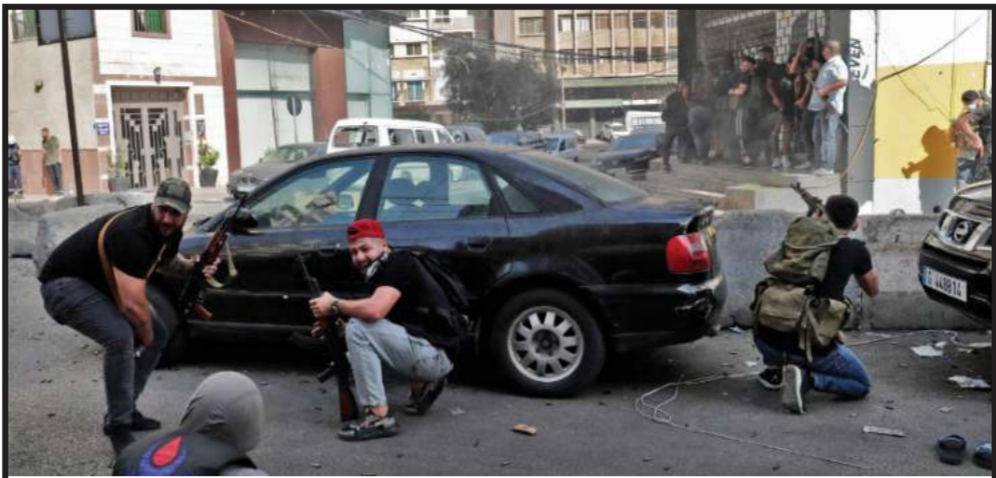
Hezbollah fighters taking positions after their march came under heavy fire in Downtown Beirut

Flights between Afghanistan and Pakistan have been severely limited since Kabul airport was reopened last month in the wake of the chaotic evacuation of more than 100,000 Westerners and vulnerable Afghans following the Taliban victory.