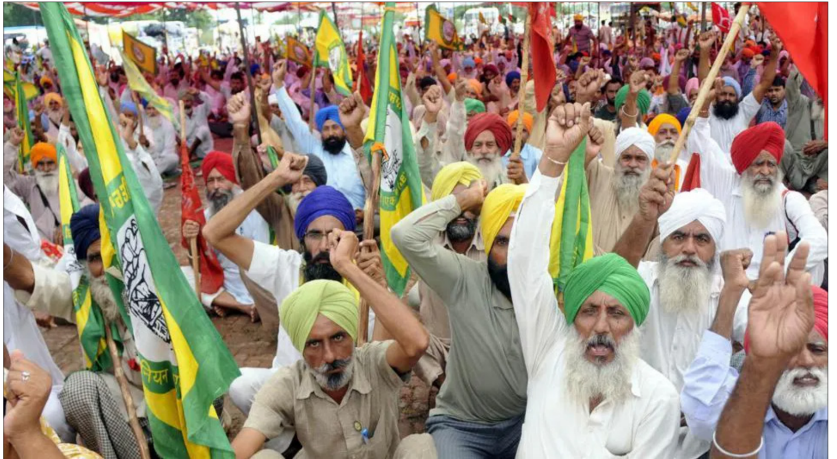
FARM LEADERS AND FARMERS STAGE A PROTEST over violence in Lakhimpur Kheri on Sunday, in Patiala, Monday, Oct. 4, 2021.

The Farmers' Agitation Challenges Theoretical Wisdom