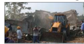
KO NEWS SERVICE

SRINAGAR: To ensure timely completion of Noor Jehan Bridge at Noorbagh Qamarwari over River Jehlum, a team of District Administration Srinagar today launched a massive anti encroachment drive here today.