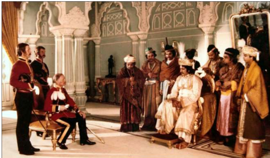
The misreading of the modern nation state. The misreading of the modern contract and notions of legality (symbolized by company's attempt in brushing aside the earlier 1837 treaty). Misreading of authority and power. Misreading of the relative values of the Indian kingdoms viz a via the sovereign power of the British monarchy.

this shadowy presence of the English monarch across the oceans. And it is this clockwork regiment of the English officialdom which uses the language of treaties, revokes the agreement of treaties, which breaks the treaty turns as in when