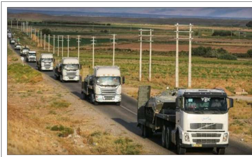
Iran's military launched a large military drill near the country's border with Azerbaijan, in a show of force amid tensions with its neighbouring country partly linked to the latter's close ties with Israel.

"Over-the-horizon operations don't always have to include unmanned aerial assets, and they don't. That we use unmanned aerial assets clearly is true, and the Secretary (of Defence) cited one that was just a week or two ago in Syria. But over-the-horizon doesn't have to mean unmanned. It doesn't even always have to mean aviation," he said.