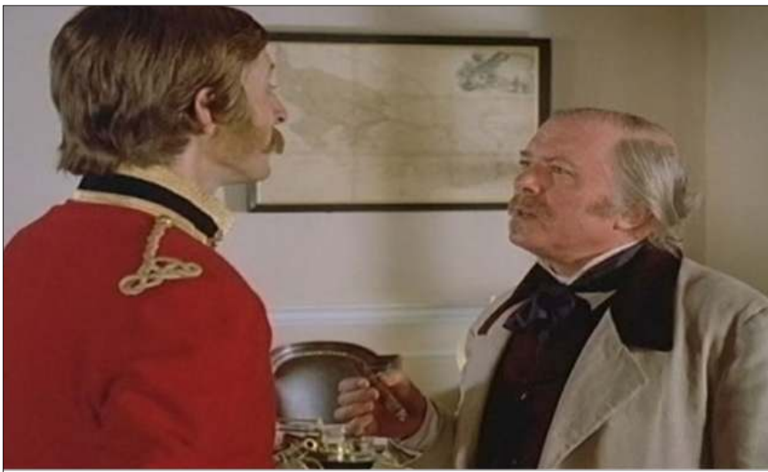
Orientalism as a larger framework (best symbolized by a dialogue between General Outram and Colonel Weston). The movie gives you the domain of substitution & subjective power.

the blindness of the Indian ruling classes.