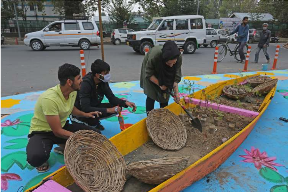
Smart City: Students paint roads near Sher-e-Kashmir park Polo view Srinagar

Pole also informed that a tour shall be also conducted on Wednesday to assess the situation and / improvement and any deviation to the orders/ directions passed in the tour shall be viewed very seriously and action as warranted shall be against the officers who have not adhered the directions in letter and spirit—(KNO)