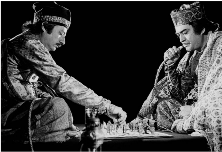
Shatranj Ke Khidari is actually from this understanding of the location of the elite time. But they miss the larger moves on the Indian chessboard.

In this way, we are exploring how Satya-