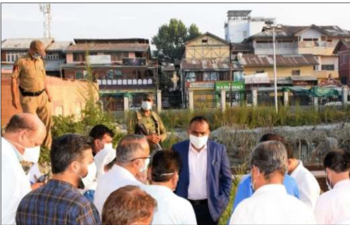
200 bedded Block at Lal Ded hospital.

and complete the project at the earliest. Further, he directed them to submit the complete details of the project including project cost, administrative approval, design, starting date of construction and reason of extended time taken. The officers of Estates department informed that the project involves the cost of Rs 72.90 lakh and will be completed in the month of November. At Lal Ded, Div Com inspected progress of work of under construction gate and additional gynecology block being executed under JTRFP project with a estimated cost of Rs. 13250 lakhs besides component of additional