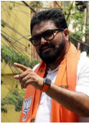
meeting BJP president J P Nadda, the Asansol MP had said he would continue to discharge his constitutional responsibilities as a parliamentarian but would withdraw from politics and leave his official residence in the national capital.