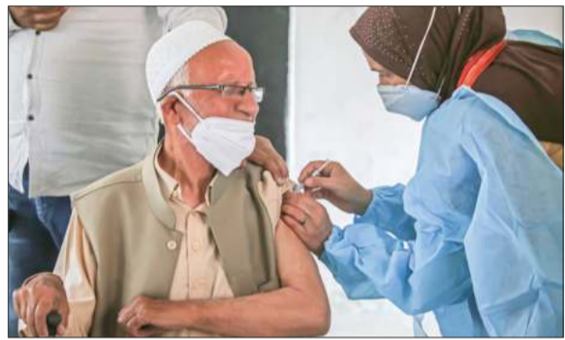
An elderly man receiving a vaccine jab at a health centre in Srinagar on Saturday.

CAB Violators In City To Be Slapped With Fine: Div Com