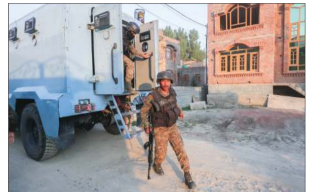
Security personnel rushing towards the shootout site in Noor Bagh area on Saturday.