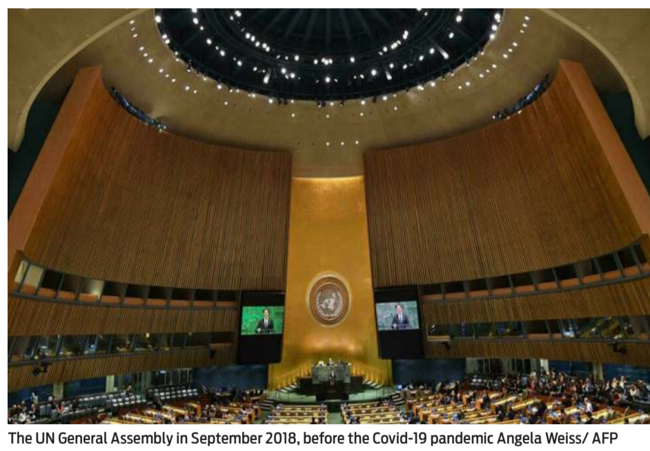
The UN General Assembly in September 2018, before the Covid-19 pandemic

across the region and protect Iran from unilateral punishments from the West. He said Iran's geopolitical position, population, energy supplies, transport potential, workforce and culture can provide "meaningful momentum" to major regional masterplans, including China's Belt and Road Initiative. "The world has entered a new era," Raisi said. "Hegemony and unilateralism are failing. The international balance is moving toward multilateralism and redistribution of power to the benefit of independent countries." In this vein, the Iranian president referred to "sanctions or economic terrorism" as major hurdles for regional progress, and called on the SCO member states to develop structures and mechanisms to fight sanctions as a group. "Unilateral sanctions are not against only one country," he said. "As it has become evident in recent years, sanctions have targeted more independent countries, especially members of the organisation."