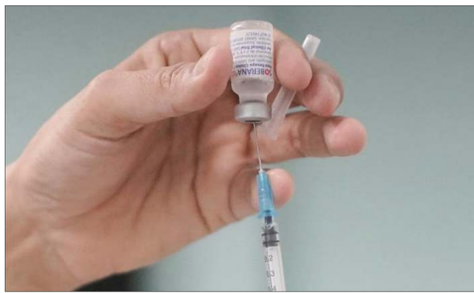
A nurse prepares a dose of the Soberana O2 vaccine during its clinical trials at a hospital amid concerns about the spread of the coronavirus disease in Havana, Cuba.

But he believed he was acting correctly "to ensure there was no historic rupture in the international order, no accidental war with China or others, and no use of nuclear weapons," they said.