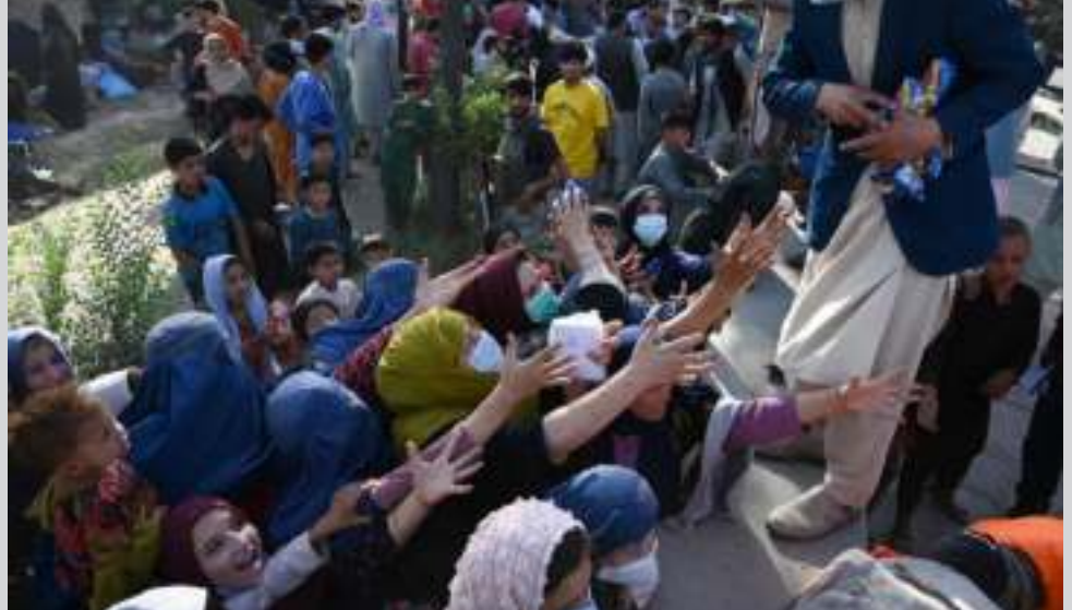
Internally displaced Afghan families, who fled from Kunduz and Takhar province due to battles between Taliban and Afghan security forces, collect food in Kabul.

Deepening food crisis compounds Afghanistan's problems