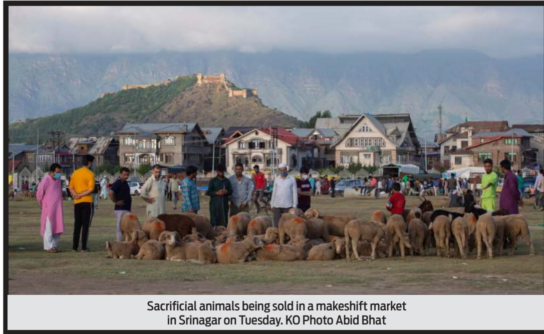
Sacrificial animals being sold in a makeshift market in Srinagar on Tuesday.

During the drive thorough inspections were conducted and on spot instructions were issued to the license holder’s for strict adherence to the conditions of the license. The Chemists were asked to maintain sale and purchase records of various drugs properly, to maintain storage conditions of the drugs as per their requirement and issue bills/cash memos regularly.