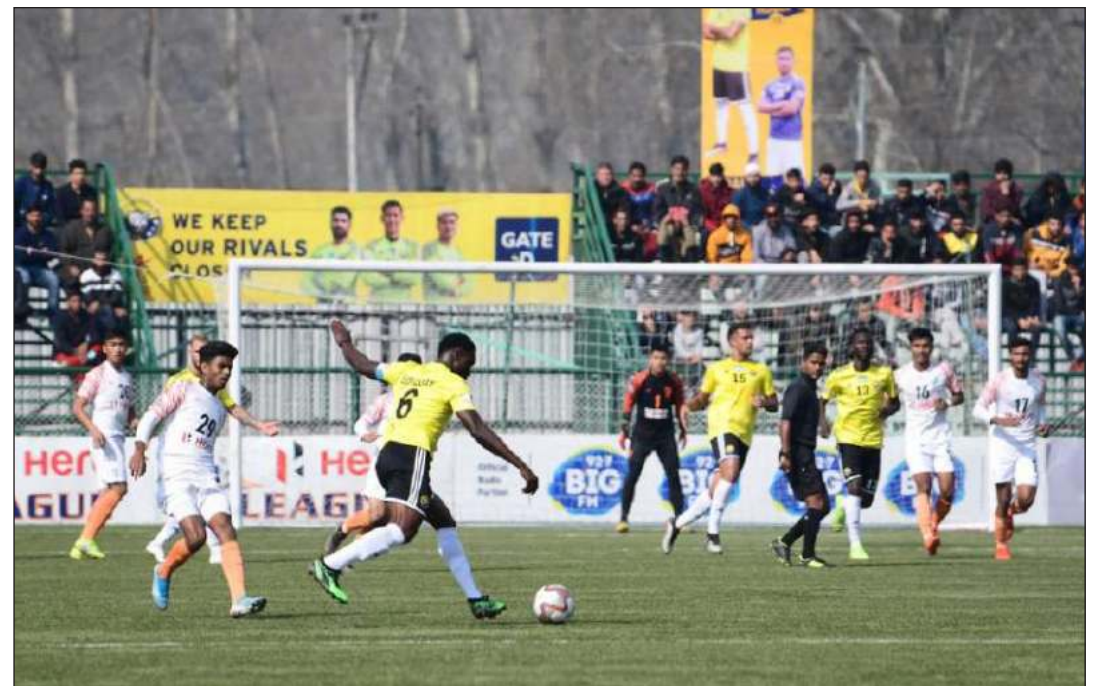
Players from the Real Kashmir and Indian Arrows football clubs play during their I-League Football match at the TRC Turf Ground in Srinagar on Monday, February 24, 2020.

Even if the authorities undertake projects to upgrade the football infrastructure in the valley, they fail to complete them on time. The upgrading means that stadiums will be out of bounds