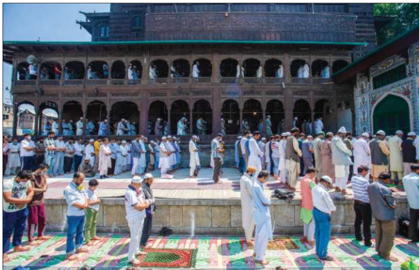
Devotees offer congregational prayers at the shrine of Hazrat Mir Syed Ali Hamadani (RA) in Khanqah-e-Moula here on the 656th Urs of the Sufi scholar who visited Kashmir in the 13th century.

SRINAGAR: At least four army personnel sustained injuries after a vehicle they were travelling in met with an accident at Boniyar area in north Kashmir's Baramulla district on Saturday. Official sources said that an army vehicle of 30 Rashtriya Rifles part of a convey enroute to Kupwara hit the wall of an apple juice factory at Boniyar on Saturday afternoon, resulting in injuries to four on board army personnel. The injured personnel have been. ● More On P10