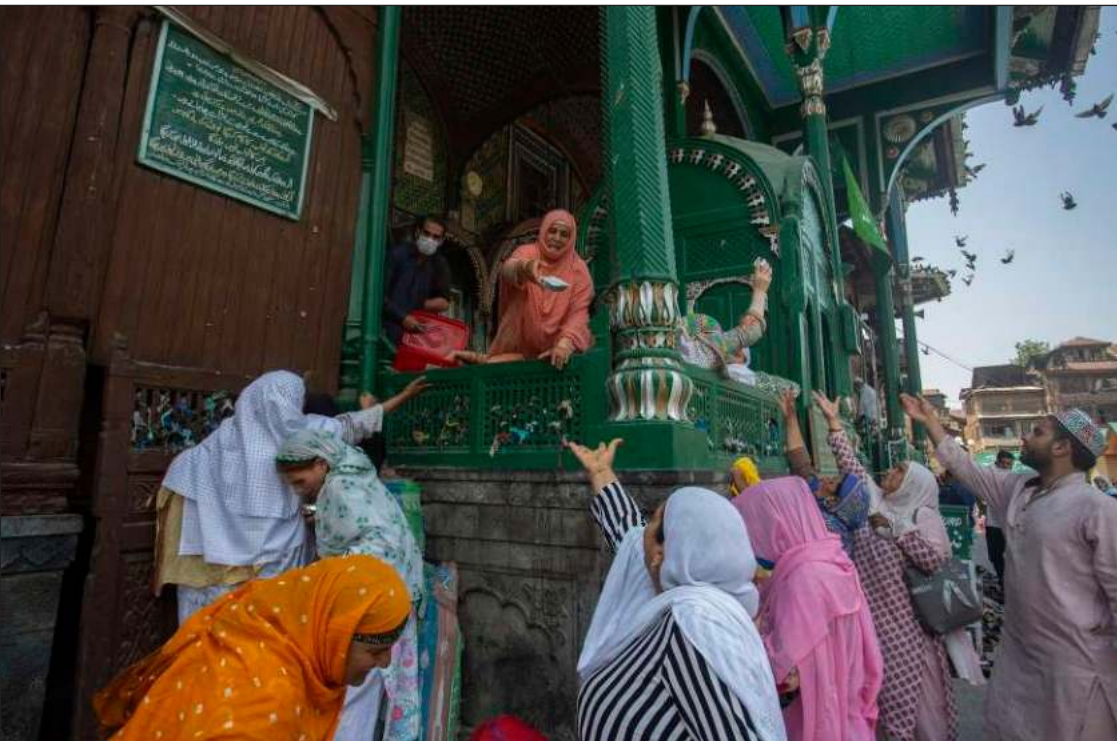
SPIRITUAL ABODE: Khanqah-e-Moula, built by Sultan Sikander in 1395, is one of the oldest Khanqah's in Kashmir. It is dedicated to Hazrat Mir Syed Ali Hamadani (RA) who came to Kashmir from the city of Hamadan in Persia in the 13th century.

"Generically, the intended benefit of this program for the University and college-going students is to nurture and spur the problem solving attitude by creatively understanding the rural, urban ecosystem. Provide solutions using the Design Thinking approach," he said.